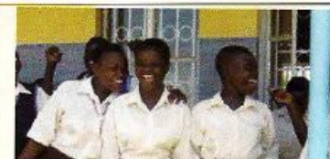
continued on page 3

values instilled in her at Bishop Ward as the inspiration for her mission.