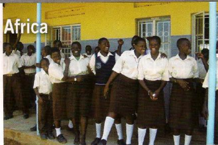
Students take roll outside of the flourishing John Paul Secondary School in Chelekura, Uganda.